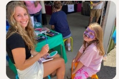
Our Teens for Life working hard at face painting all week!